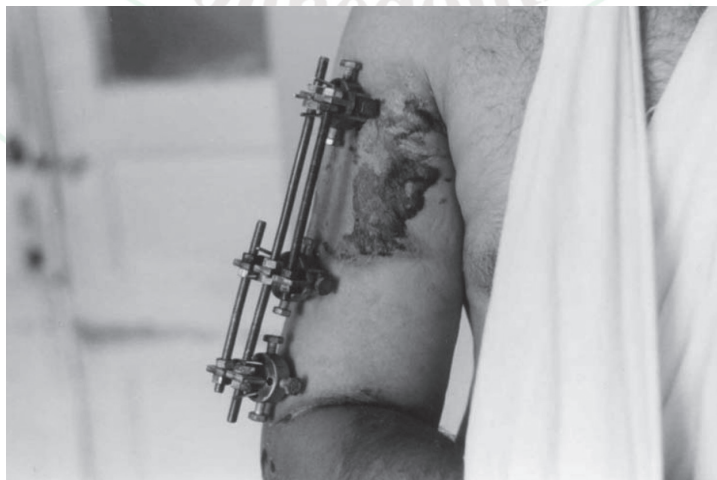
Figure 1: Patient O. with the apparatus of A.D. Abdullayev on the humerus at the beginning of treatment.

The total duration of hospital treatment of patients was 32 days. Osteosynthesis of open fractures of the long bones of the extremities by the method of external fixation was performed in 189 (80.8%) patients, metal synthesis – in 45 (19.2%). Long-term results of treatment were determined in 110 patients of 234 people treated. We monitored these patients within 5 yrs. As a