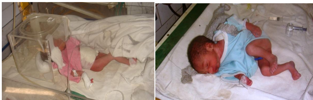
Table 1: Risk indicators for preterm low birth weight babies.