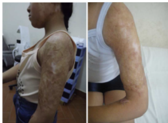
Figure 4: Post burn scar in upper limb treated by ablative laser change of height and pliability.

The comparison for Vancouver Scar Scale VSS results among the two groups for pre and post-treatment assessment the data were analyzed using nonparametric test (Mann-Whitney Test) to detect any significant differences between the two groups, the obtained results showed that comparing the results in pre and post revealed highly significant differences for pigmentation, vascularity, pliability and height as p=0.0001 . If we compare both groups as two different treatment modalities (ablative and fractional) we found that the obtained results showed highly significant differences in post-treatment on contrary of pretreatment, as p=0.004 , 0.01 , 0.0001 and 0.005 for vascularity, pliability, pigmentation and height respectively as shown in Figure 4. All results in pretreatment comparison between the two groups showed no significant difference as p>0.05 .