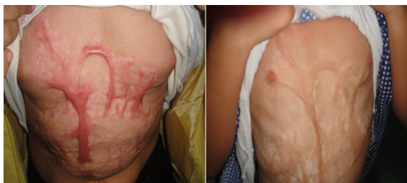
Figure 1: Post burn scar in the trunk area treated by fractional laser change of height and pliability.