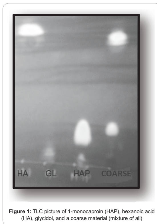
Figure 1: TLC picture of 1-monocaproin (HAP), hexanoic acid (HA), glycidol, and a coarse material (mixture of all)

The synthesis of 1-monocaproin was achieved with the catalyst content of 1% by mass of charged reactants, and at 90°C, yield achieved was 65% in 180 min. 1-Monocaproin synthesized with the reaction of glycidol by chromium-caprylic fatty acid complexes changes the nature