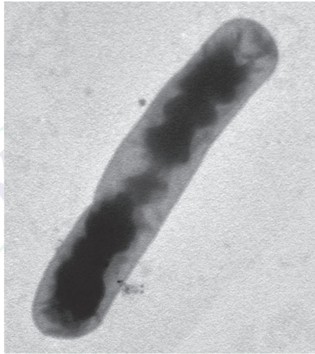
Figure 2: Corynebacterium : increase 12,000 nm. Transmission electron microscope JEM-1011.

animals of the experimental group as compared to the control one – 9.5%.